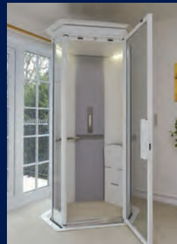
Lifestyle Home Lift

If you haven't previously considered a home lift, speak directly to the manufacturer and join the many customers who are experiencing the convenience and reliability of a Terry Lift. Call 0330 053 6779 to ask any question, or to arrange a consultation.