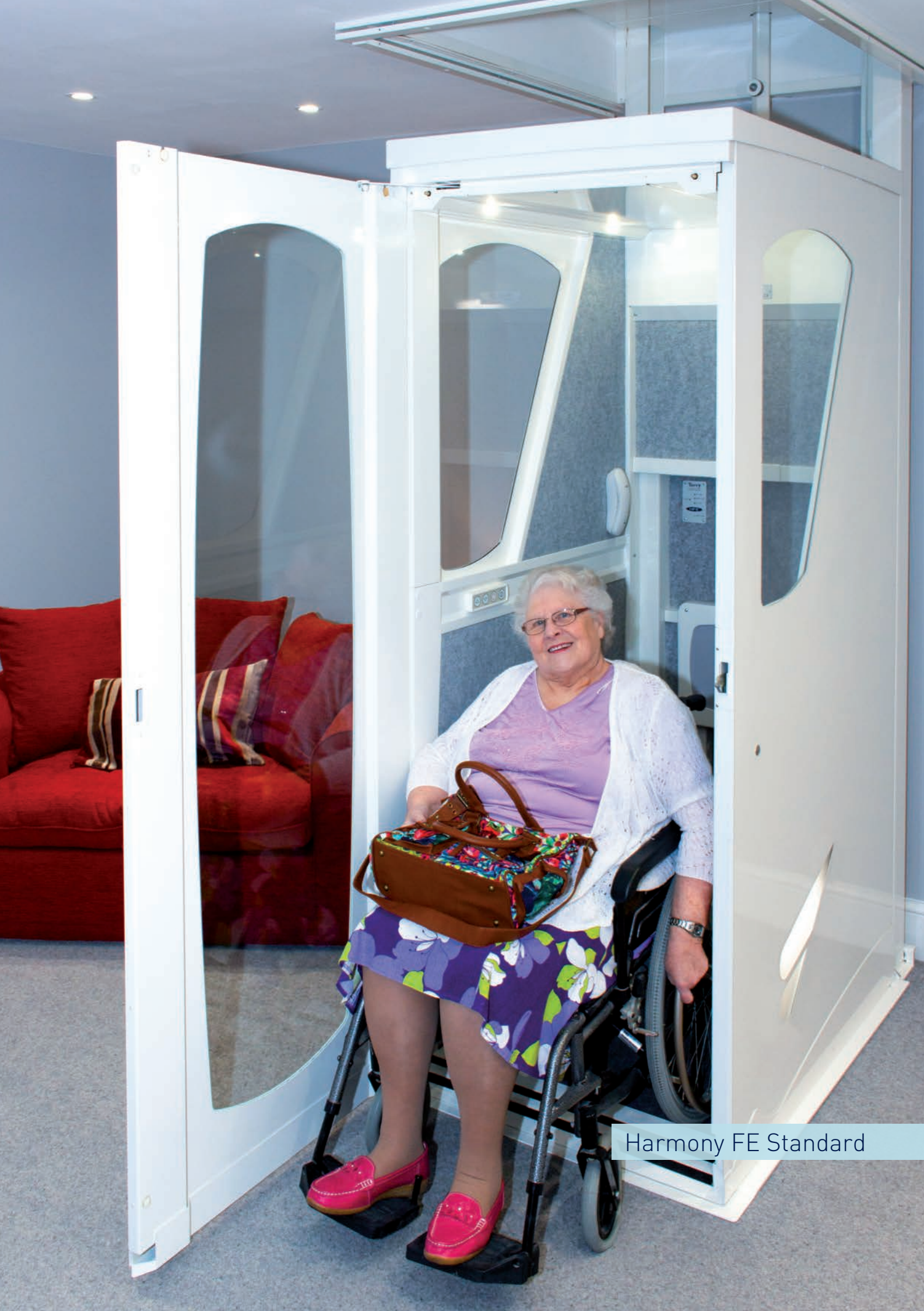
Harmony FE Standard