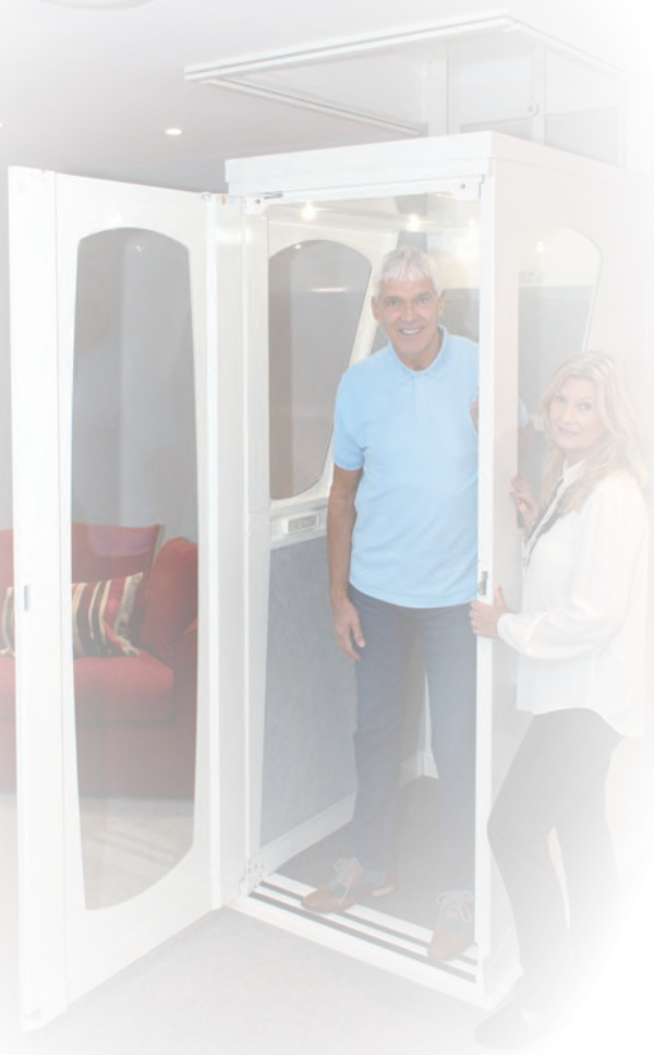
Harmony FE Home Lift

If you haven't previously considered a home lift, speak directly to the manufacturer and join the many customers who are experiencing the convenience and reliability of a Terry Lift. Call 0330 053 6779 to ask any question, or to arrange a consultation.