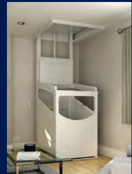
Harmony Home Lift