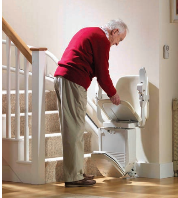
The Siena folds neatly away when not in use