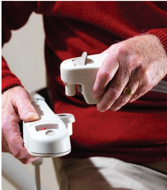
Seatbelt can be fastened with one hand

Effortless and simple. This sums up beautifully just how much thought and care we have designed into each and every function of our Siena stairlift. From the safe and easy-to-use seatbelts, to stairlifts that fit on either side of the stairs and on all types of staircases, we have made your Siena stairlift simple, safe and reliable.