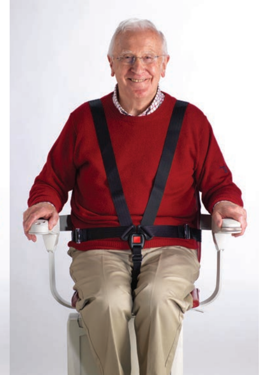
Five point harness