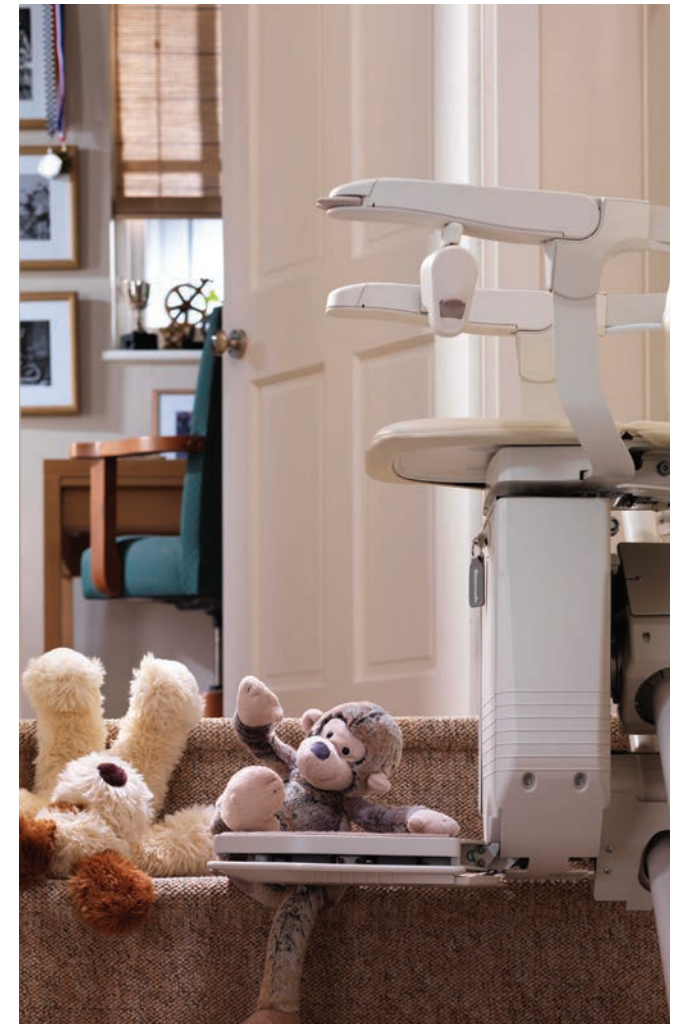
Sensors detect any obstructions on your stairs

“We are delighted with the stairlift. My wife enjoys the ride. It gives her independence. She finds it very easy to use”