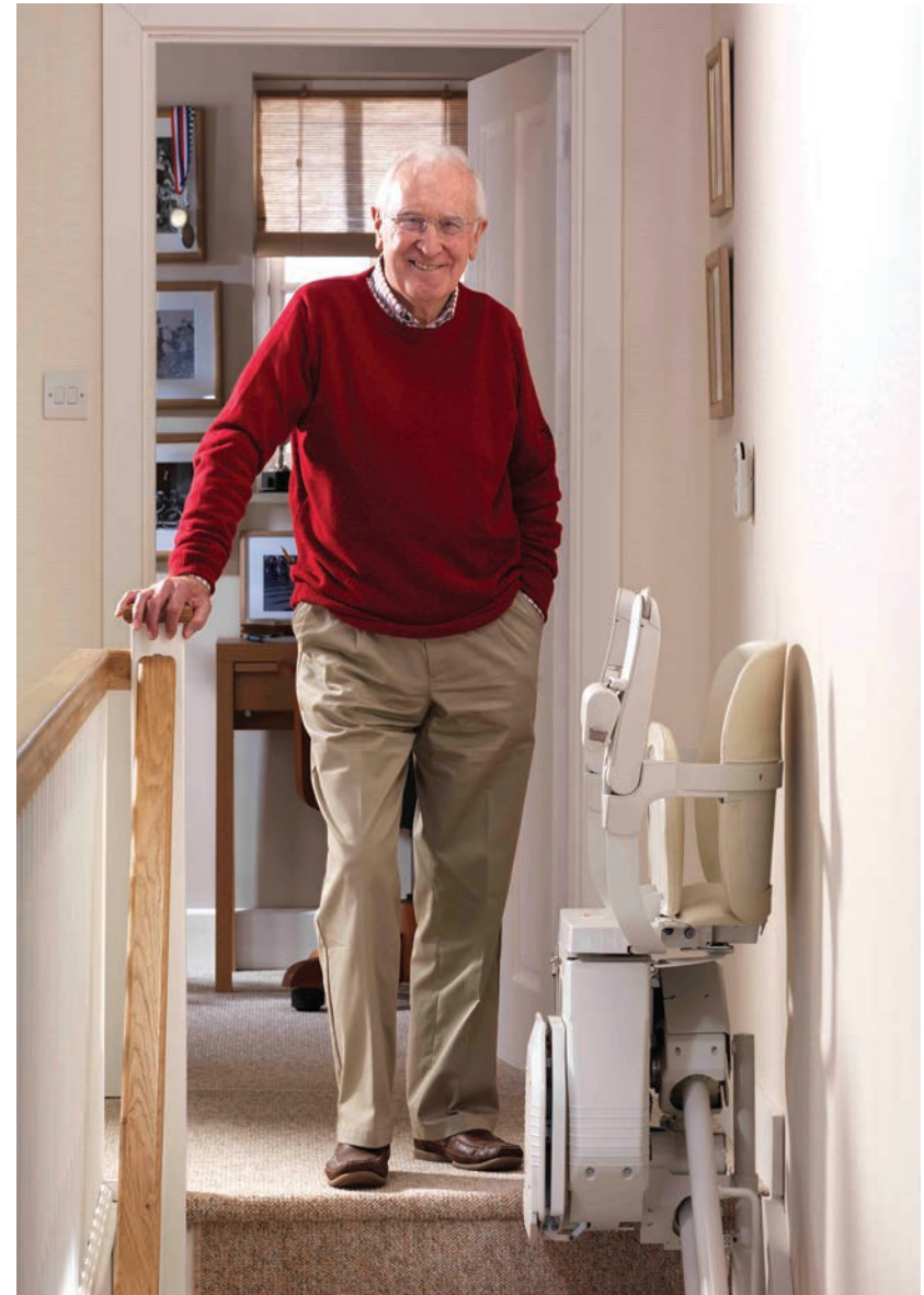
The Siena's slimline design allows others to still use the stairs

The Siena also comes in two chair widths allowing you to pick the one most comfortable for you, your home and your life.