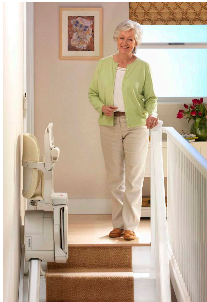
The Siena's slimline design allows others to still use the stairs

The Siena also comes in two chair widths allowing you to pick the one most comfortable for you, your home and your life.