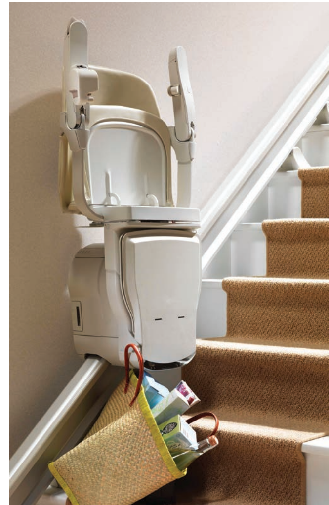
Sensors detect any obstructions on your stairs

“We are delighted with the stairlift. My wife enjoys the ride. It gives her independence. She finds it very easy to use”