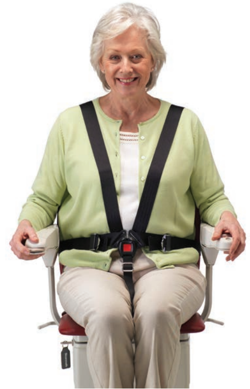
Five point harness