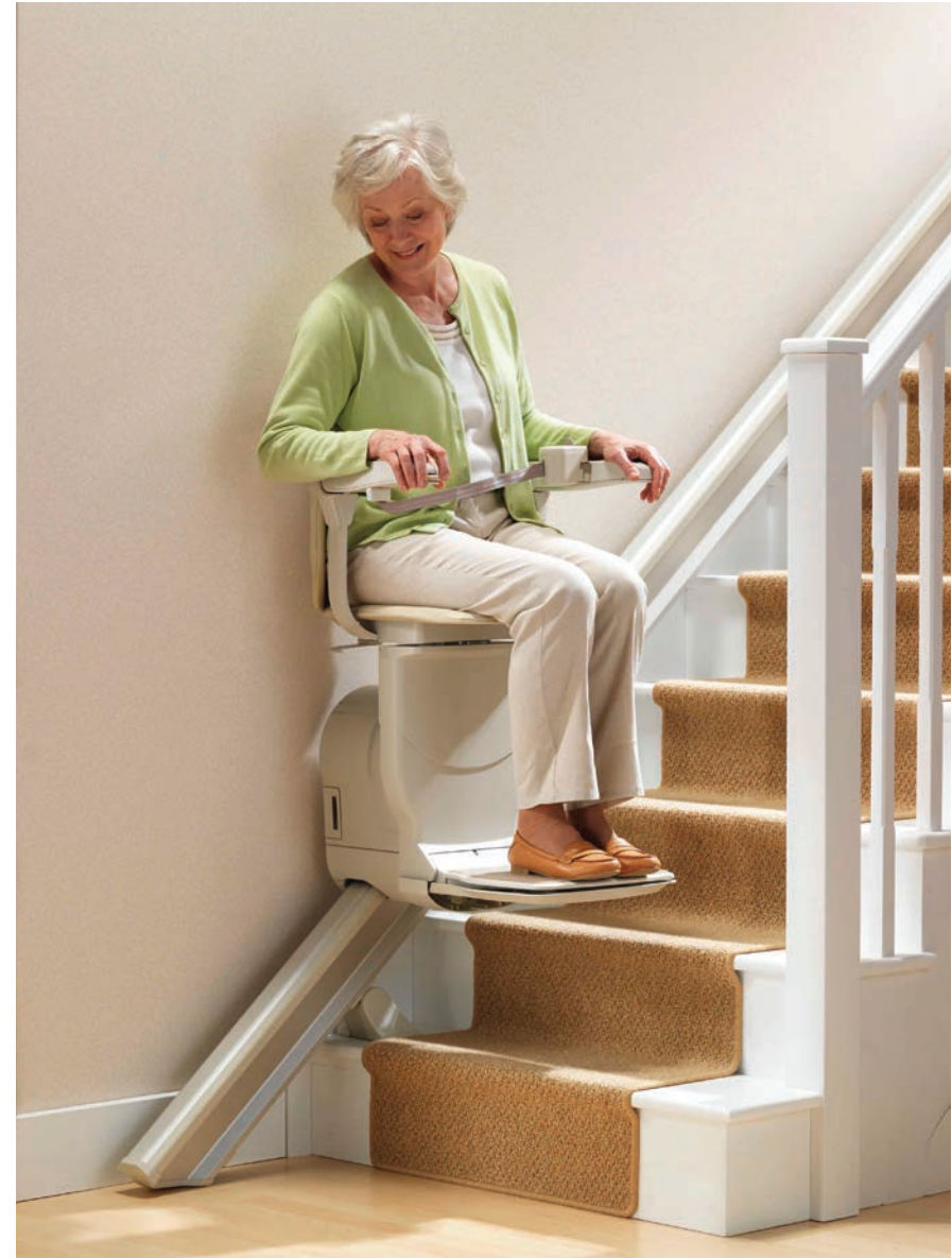
A gentle touch of the controls is all it takes to climb your stairs