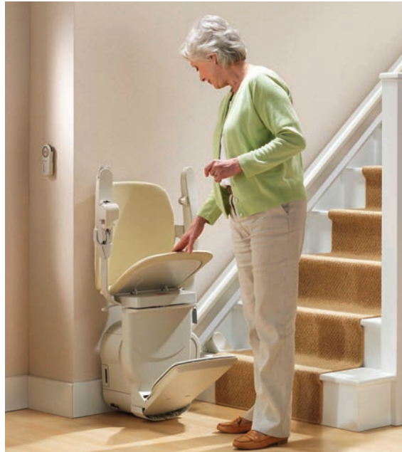
The Siena features a seat-to-footrest link