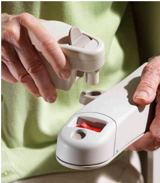
Seatbelt can be fastened with one hand

Effortless and simple. This sums up beautifully just how much thought and care we have designed into each and every function of our Siena stairlift. From the safe and easy-to-use seatbelts, to stairlifts that take up minimal space on your staircase, we have made your Siena stairlift simple, safe and reliable.