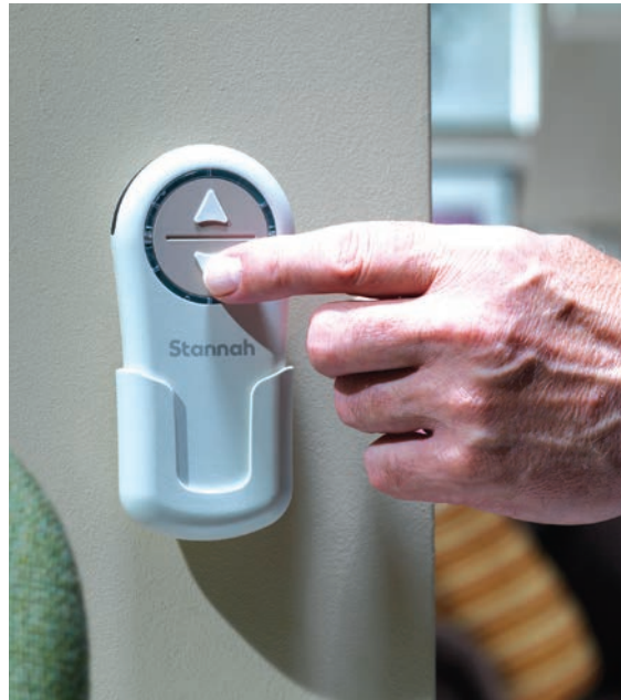
Use the wall control to call your Starla