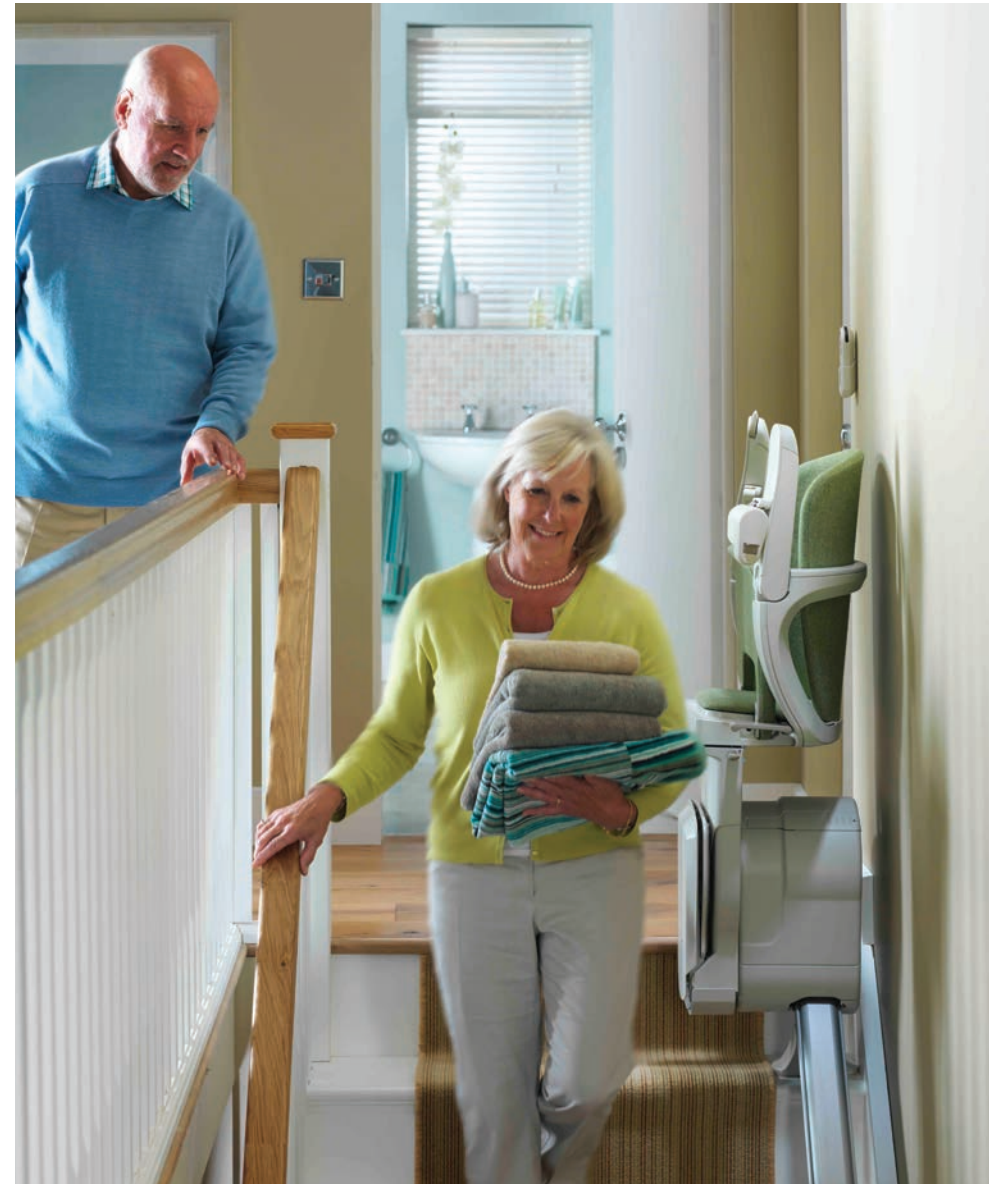
The Starla's slimline design allows others to still use the stairs

Tailor it to your tastes and home by choosing a fabric, with or without a light or dark wood finish or select the full vinyl upholstery in a range of sophisticated colours.