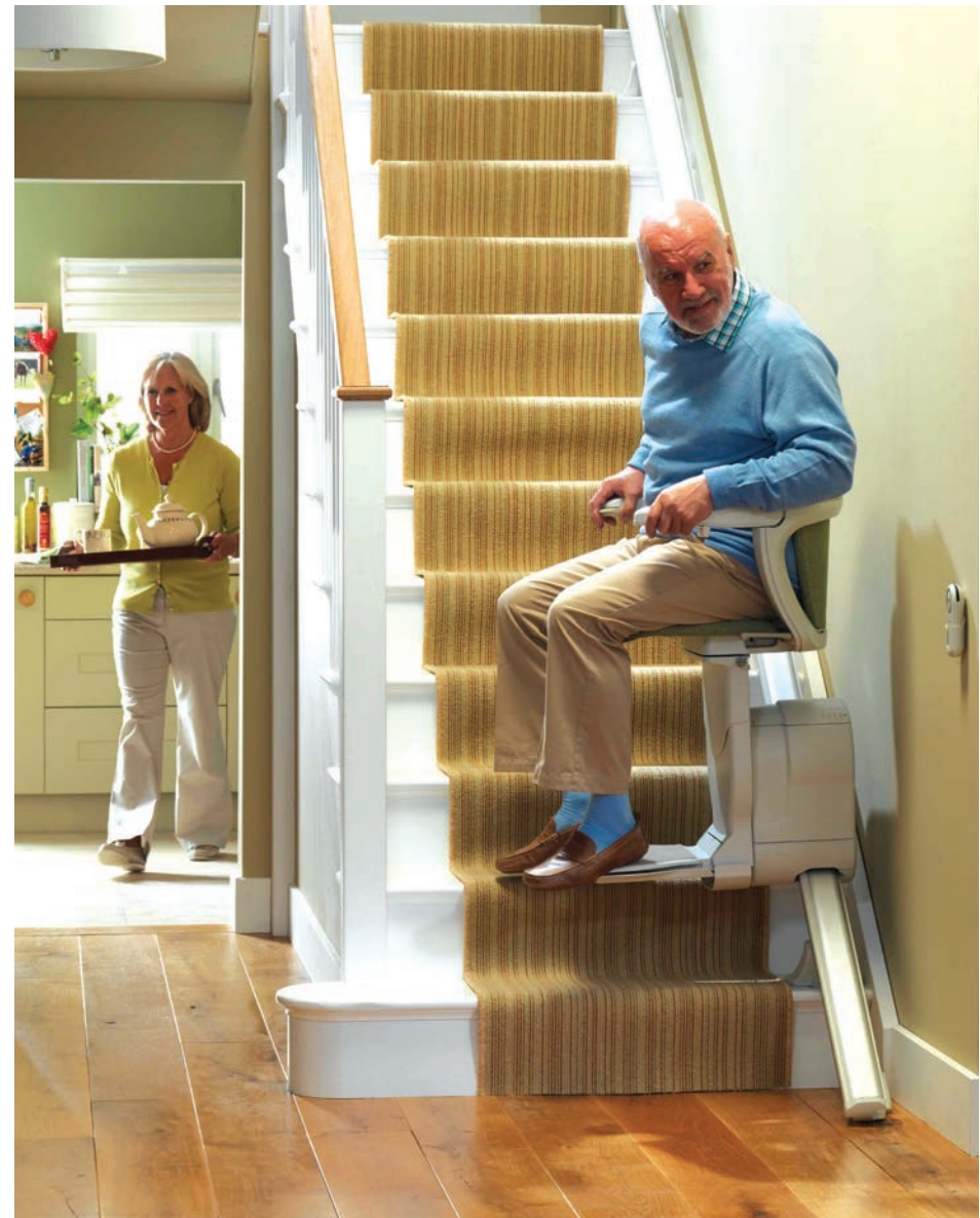
A gentle touch of the controls is all it takes to climb your stairs