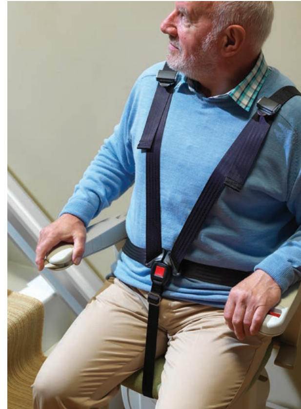
Five point harness