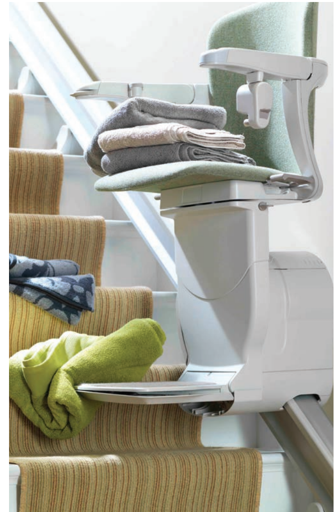
Sensors detect any obstructions on your stairs

"We are delighted with the stairlift. My wife enjoys the ride. It gives her independence. She finds it very easy to use"