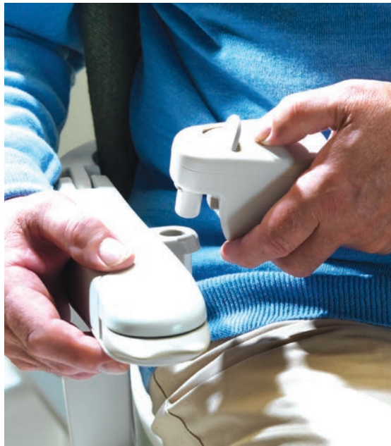
Seatbelt can be fastened with one hand

Effortless and simple. This sums up beautifully just how much thought and care we have designed into each and every function of our Starla stairlift. From the safe and easy-to-use seatbelts, to stairlifts that take up minimal space on your staircase, we have made your Starla stairlift simple, safe and reliable.