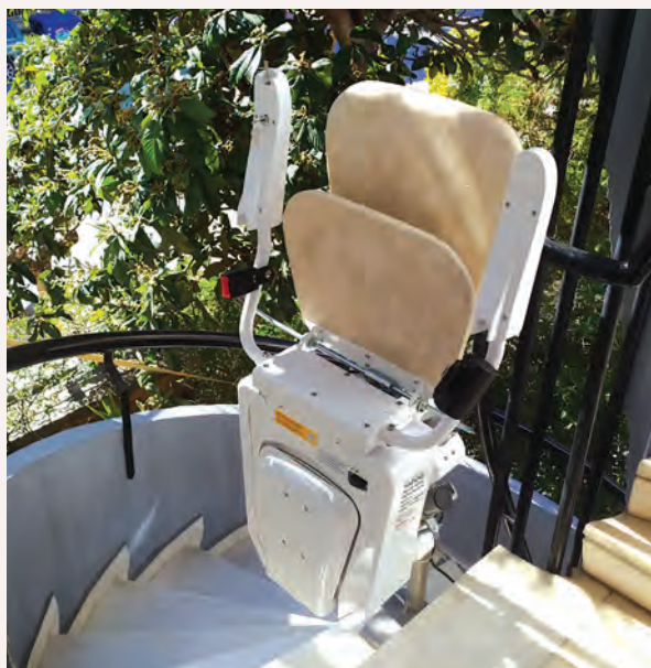
Stannah Outdoor Curved allows others to still use the stairs