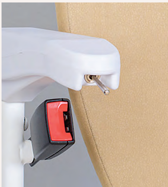
Stannah Outdoor Curved has an easy-to-use joystick

From the safe and easy-to-use joystick, to a protective cover for your Stannah Outdoor Curved, we have made your outdoor stairlift simple, reliable and protected from the weather.