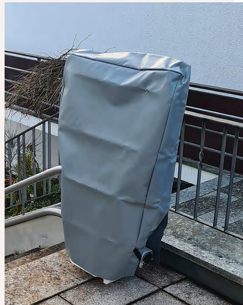
For extra protection, Stannah Outdoor Curved has a protective cover

“We are delighted with our Stannah Outdoor Curved stairlift. My wife is now able to fully appreciate and enjoy our garden again”